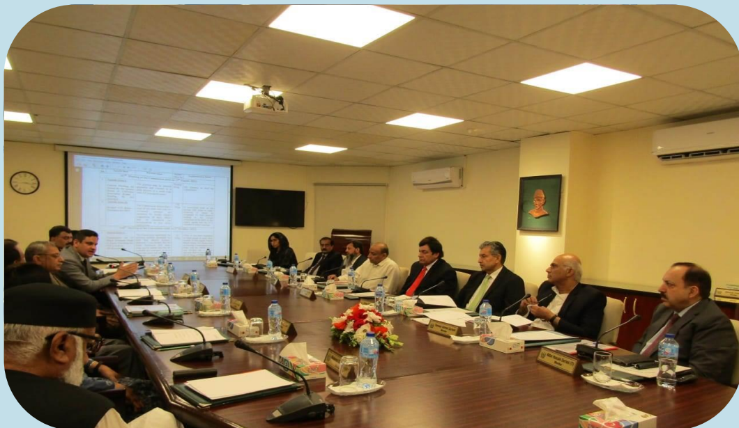
169 th Commission Meeting in progress at FPSC Headquarters, Islamabad on 09.05.2024.

The Commission discharges its duties and performs functions in accordance with Constitution of Islamic Republic of Pakistan and assists the Government of Pakistan in achieving sustained good governance by providing quality human resource through fair, transparent and open competition. Updates on major activities of the Commission during April-June, 2024 are as follows: