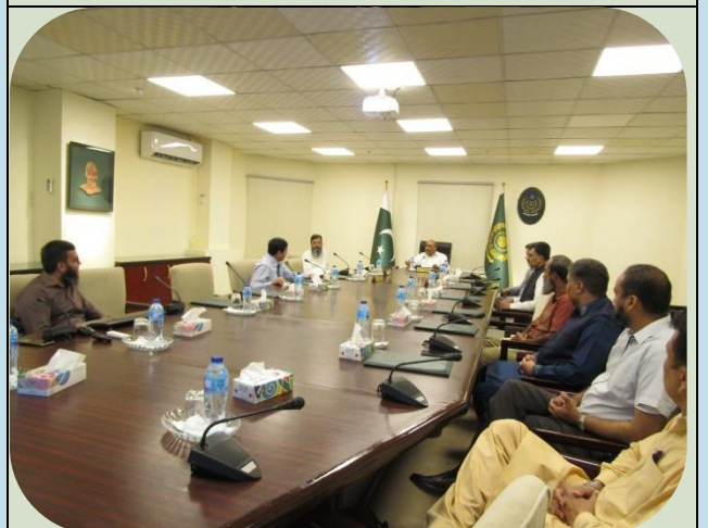
Secretary, FPSC chaired a meeting at FPSC Headquarters, Islamabad on computer based testing project progress