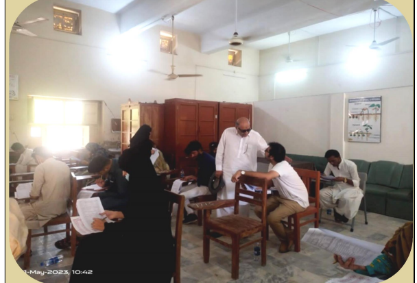
View of visit of Secretary FPSC at examination centre Hyderabad