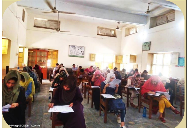
MPT CSS Competitive Examination-2023 in progress at Hyderabad Center.