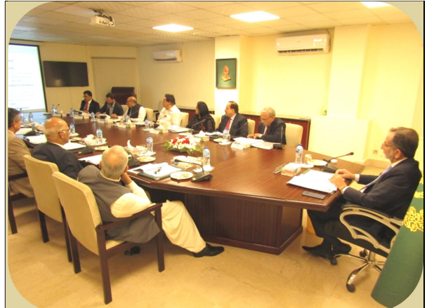
166 th Commission Meeting in progress at FPSC Headquarters, Islamabad