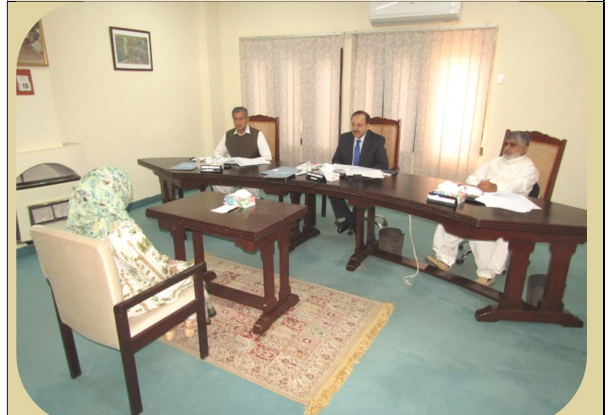
View of Interview Committee conducting Interview sessions with candidates qualified for General Recruitment posts advertised during April-June, 2023