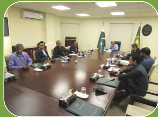
Discussion on IT Solutions with guests from Malaysia at FPSC Headquarter, Islamabad.