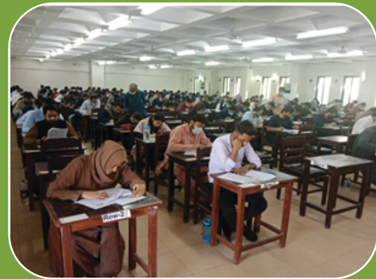
View of General Recruitment Tests held at Karachi.