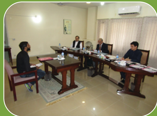
Interview for General Recruitment 2022.