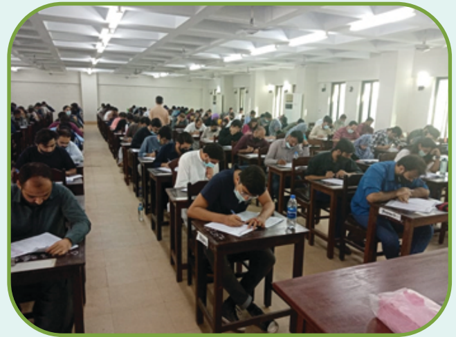
Candidates attempting CSS Competitive Examination 2022 at Karachi.