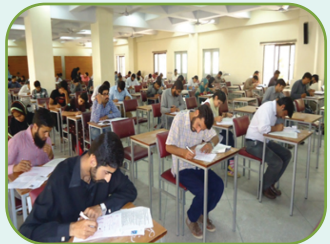
View of General Recruitment for Ex-Cadre positions during the period under report at FPSC Headquarter, Islamabad.