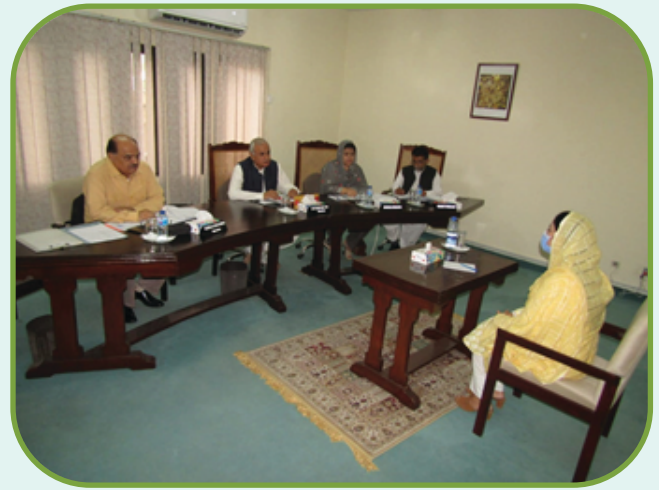
Committee of Members of the Commission conducting Interviews for Ex-Cadre positions at FPSC Headquarter, Islamabad.