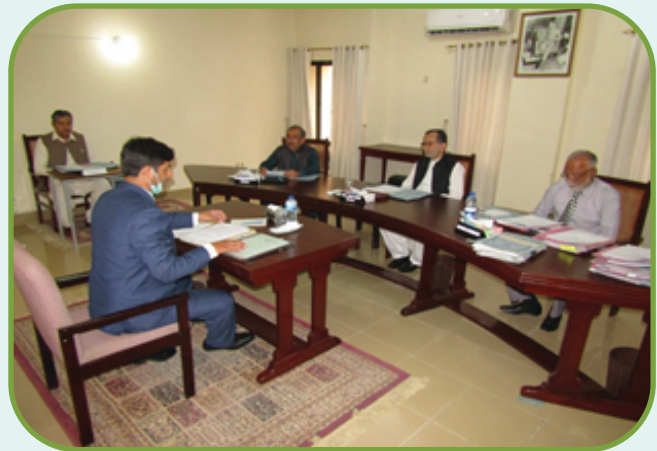
Interview for General Recruitment 2022